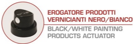
EROGATORE PRODOTTI VERNICIANTI NERO/BIANCO BLACK/WHITE PAINTING PRODUCTS ACTUATOR