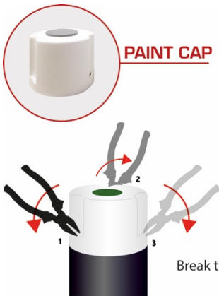
Break three safety seals clips to open the cap.

2. Shake well before use the spray at least 1 minute, until the internal balls can move freely. It's recommended to shake the product even during use.